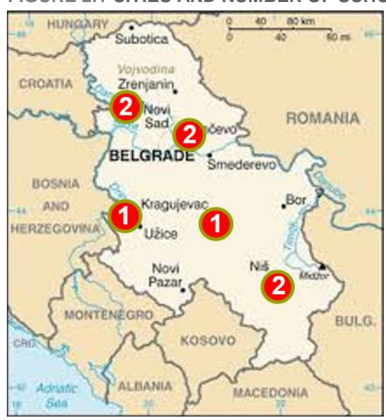
FIGURE 2.1 CITIES AND NUMBER OF SCHOOLS VISITED

Eight SVET schools in major cities in Serbia were selected for the field visits. The selection was based on their good practice in respect of DOL provision. The selection process of schools to be visited was discussed with the steering group, based on information from the Ministry of Education, Science and Technological Development, after consultations with local experts involved in DOL and the recognition of quality of current practices in each of the schools. The list of schools to be visited was finalised in June 2015 ( TABLE 2.1 ). A ninth school was also selected for the visit. Since this institution falls