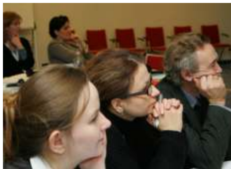
Participants in the plenary session

Finally, a part of journalism that is often overlooked from the sidelines but is crucial in the daily management of any media outlet is the relationship with lawyers. It was rightfully stressed that media training for lawyers and support to the training of specialist lawyers who could take on lawsuits following from media reporting was much needed and should be taken into support operations from a very early stage.