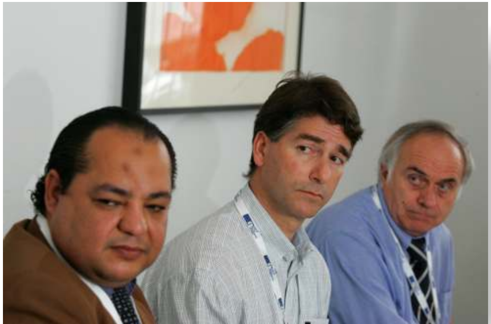
Participants in a workshop

Beirut Institute for Media Arts http://www.lau.edu.lb/centers- institutes/bima/index.html