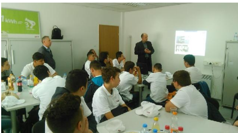
Presentation of the processes in the Customer Centers