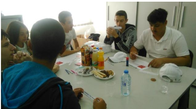
What does an electro-fitter in the company