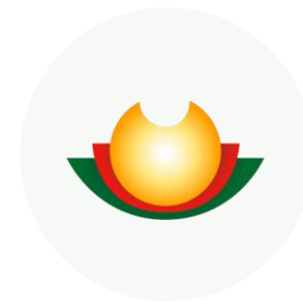
Instituto da Segurança Social, IP