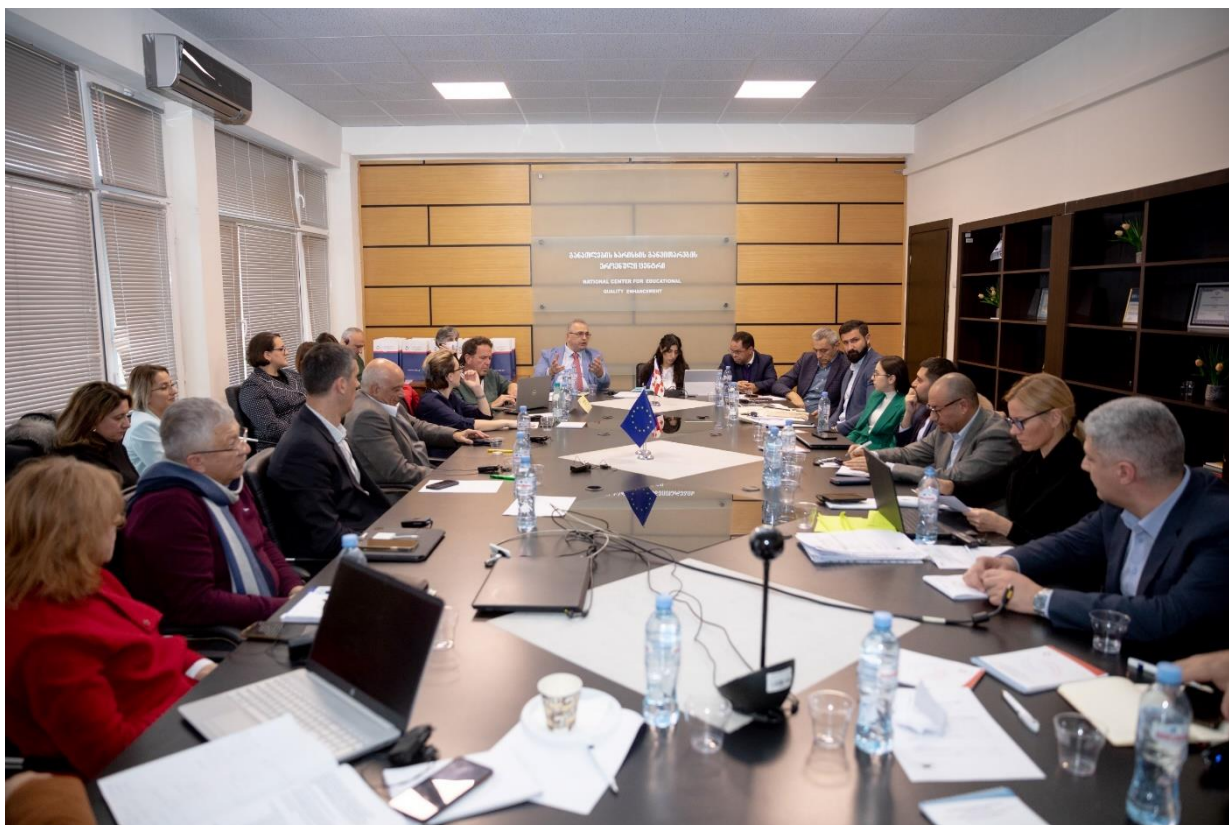
Photo of the final feedback session on 8/12/2022 at the LELP-NQEQE