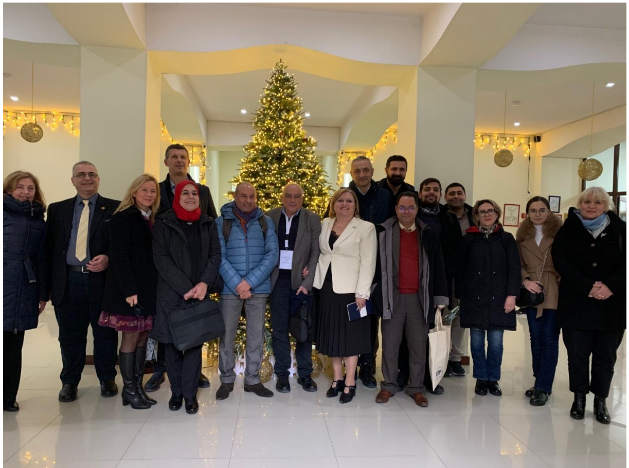
Photo: ETF Quality Assurance Forum peers and the Director of the Business Academy Georgia on 7 December 2022 in Tbilisi

Beyond the thematic focus, the report offers a comprehensive overview of the methodology systematically used by the ETF QA Forum – that of peer visits. Although the Peer visit methodology was specifically developed for the ETF QA Forum, it can be used outside of the context of the Forum. It can inspire other professionals working in the field of education, training and employment to apply it for active and effective peer learning. This report simply provides a ‘taste’ of the experience. The report follows three phases of the four-phases approach of the ETF Forum’s Peer Visit methodology: Preparation, Implementation, Reflection and Feedback.