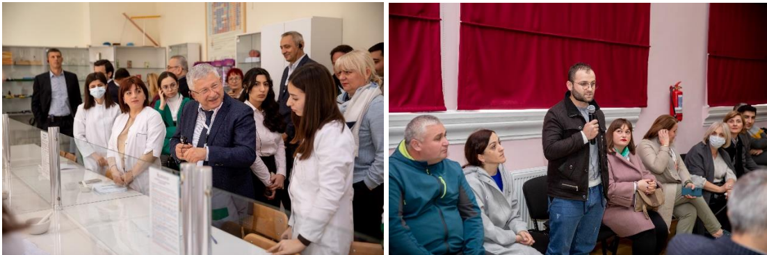
Photos from the site visit in the Business Academy Georgia on 7/12/2022 and meeting with short-term training students