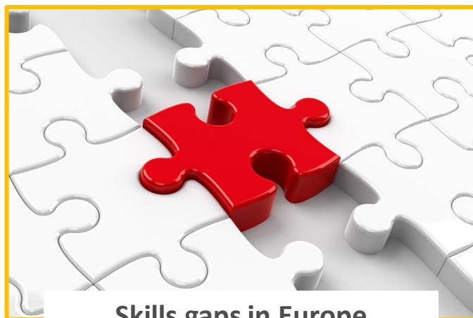
Skills gaps in Europe