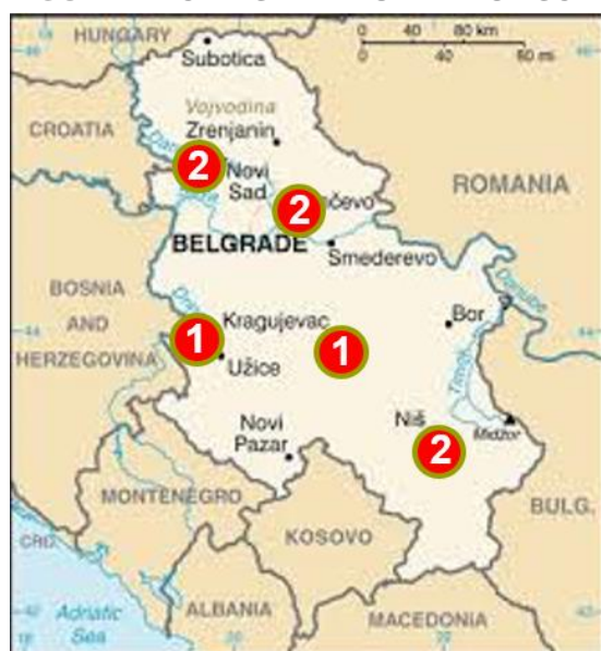
FIGURE 2.1 CITIES AND NUMBER OF SCHOOLS VISITED

Eight SVET schools in major cities in Serbia were selected for the field visits. The selection was based on their good practice in respect of DOL provision. The selection process of schools to be visited was discussed with the steering group, based on information from the Ministry of Education, Science and Technological Development, after consultations with local experts involved in DOL and the recognition of quality of current practices in each of the schools. The list of schools to be visited was finalised in June 2015 (TABLE 2.1). A ninth school was also selected for the visit. Since this institution falls